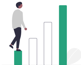
Professional Development and Career Opportunities